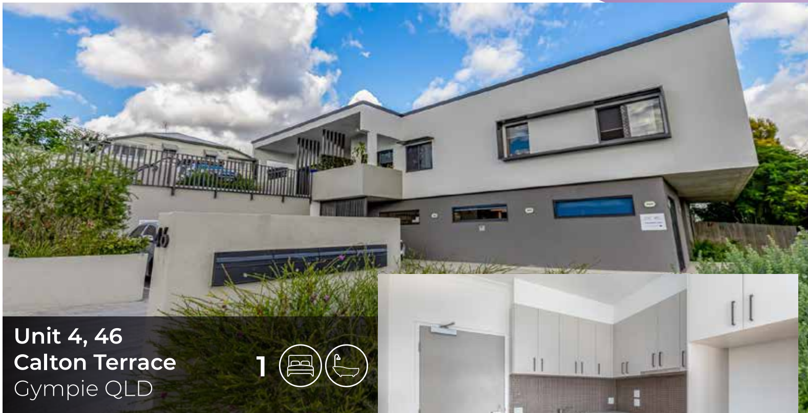
Unit 4, 46 Calton Terrace Gympie QLD